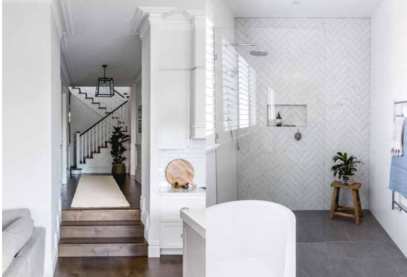
HALLWAY The intricate cornices in the hallway (top left) and Magins Classical Lighting 'Norfolk' pendant look like they could be in a period home. GIRLS' BATHROOM In the girls' bathroom (top right), Perini 'Del Marmo' tiles in Carrara (discontinued) on the feature wall pick up the shade of the Perini 'Stonefusion' floor tiles in Graphite while the Aqua Plus 'Neo' bath from E&S adds a modern touch. POWDER ROOM Perini Carrara 'Herring' honed marble wall tiles in the powder room (bottom left) echo the feature wall tiles in the girls' bathroom while the vanity in Polytec Classic White by Yarra Valley Cabinet Makers is paired with a mirror from Gallerie B Interiors. For a similar basin, try Arcisan 'Universal'.