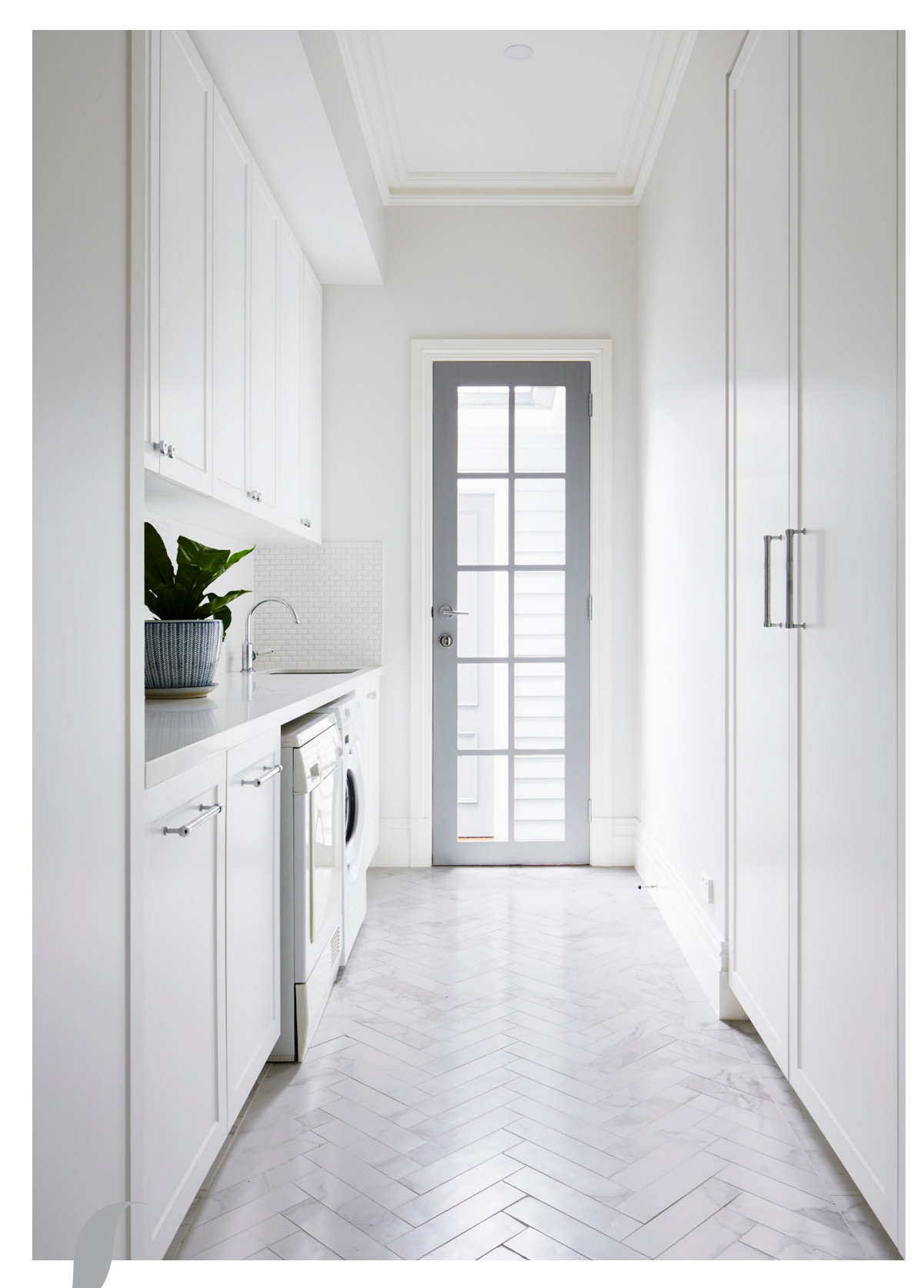
STORAGE is key IN HARD-WORKING ZONES. IF YOU HAVE THE LUXURY OF SPACE, opt for a mix OF FLOOR-TO-CEILING CUPBOARDS, OVERHEADS AND DRAWERS TO COVER ALL BASES. Mix up textures AND FINISHES TO KEEP THE WHITES INTERESTING