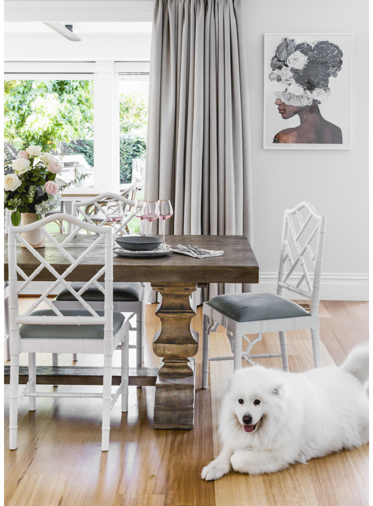
TASMANIAN OAK FLOORBOARDS SOUTHERN TIMBER FLOORS

DINING AREA Nikki hand-picked the classy dining chairs (for similar, try the 'Chippendale' chairs by Abide Interiors) and the rustic table. "We selected an extendable dining table large enough to accommodate guests and our family," she says. Get the look with Pottery Barn's 'Banks' dining table. It's also the spot where the clan gathers for their sweet tradition of pancakes on a Sunday morning. >